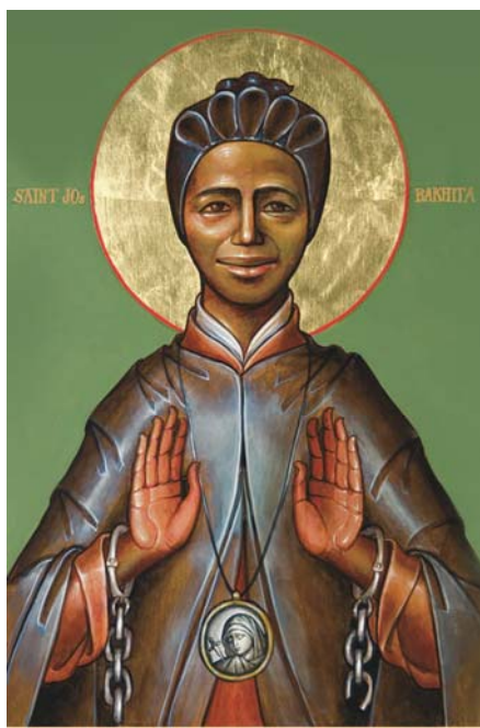
St. Josephine Bakhita